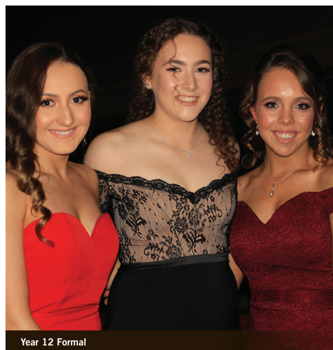
Year 12 Formal

Kyre Avenue, Kingswood, South Australia 5062 Phone: +61 8 8272 8233 Fax: +61 8 8373 3013 Email: dl.0903.info@schools.sa.edu.au