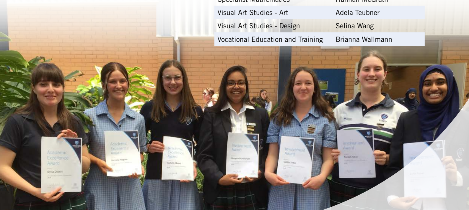
Year 11 Award Recipients